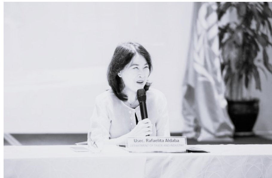
DTI-CIG Undersecretary Rafaelita Aldaba thanks guests and attendees during the launching of the GQSP Project at Makati Diamond Residences.

GQSP Project will ensure production of adequate, accessible, fit-for-purpose and safe PPE, medical devices, and sanitation products for the general population and health-care workers. The initiative is also strategic in supporting DTI's science, technology and innovation-based industrialization agenda especially in enhancing market access for these critical commodities and in promoting a culture of quality and compliance among manufacturers in the industry cluster. DTI-CIG Undersecretary Rafaelita Aldaba thanks guests and attendees during the launching of the GQSP Project on 14 October 2022 at Makati Diamond Residences. "DTI identified Health and Life Sciences cluster as one of its priority industry clusters for development. Our vision is to develop strong industrial capabilities in the biotechnology sector, pharmaceuticals, PPEs, medical devices, including digital health products and services," Usec. Aldaba added. The GQSP Project is a product of years-long coordination of DTI with SECO and UNIDO. Source: DTI